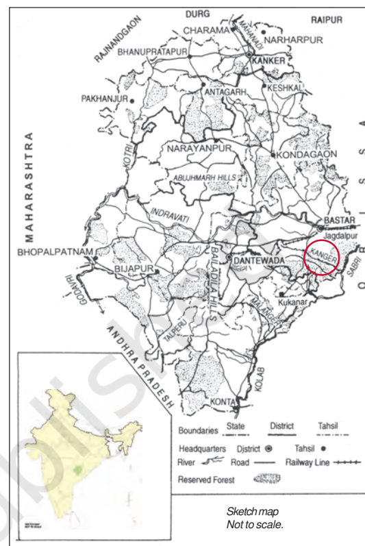
Fig.20 – Bastar in 2000.

This photograph of an army camp was taken in Bastar in 1910. The army moved with tents, cooks and soldiers. Here a sepoy is guarding the camp against rebels.