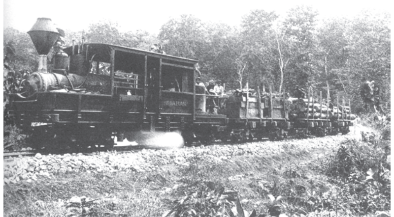
Fig.21 – Train transporting teak out of the forest – late colonial period.

As in India, the need to manage forests for shipbuilding and railways led to the