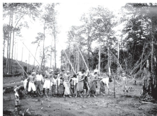
Fig. 15 – Taungya cultivation was a system in which local farmers were allowed to cultivate temporarily within a plantation. In this photo taken in Tharrawaddy division in Burma in 1921 the cultivators are sowing paddy. The men make holes in the soil using long bamboo poles with iron tips. The women sow paddy in each hole.

Children living around forest areas can often identify hundreds of species of trees and plants. How many species of trees can you name?