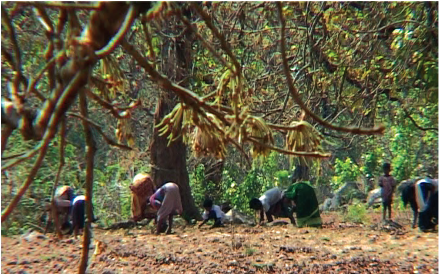
Fig. 12 – Collecting mahua ( Madhuca indica ) from the forests.

Villagers wake up before dawn and go to the forest to collect the mahua flowers which have fallen on the forest floor. Mahua trees are precious. Mahua flowers can be eaten or used to make alcohol. The seeds can be used to make oil.