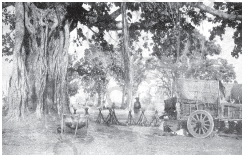
Fig.19 – Army camp in Bastar, 1910.

Bastar is located in the southernmost part of Chhattisgarh and borders Andhra Pradesh, Orissa and Maharashtra. The central part of Bastar is on a plateau. To the north of this plateau is the Chhattisgarh plain and to its south is the Godavari plain. The river Indrawati winds across Bastar east to west. A number of different communities live in Bastar such as Maria and Muria Gonds, Dhurwas, Bhatras and Halbas. They speak different languages but share common customs and beliefs. The people of Bastar believe that each village was given its land by the Earth, and in return, they look after