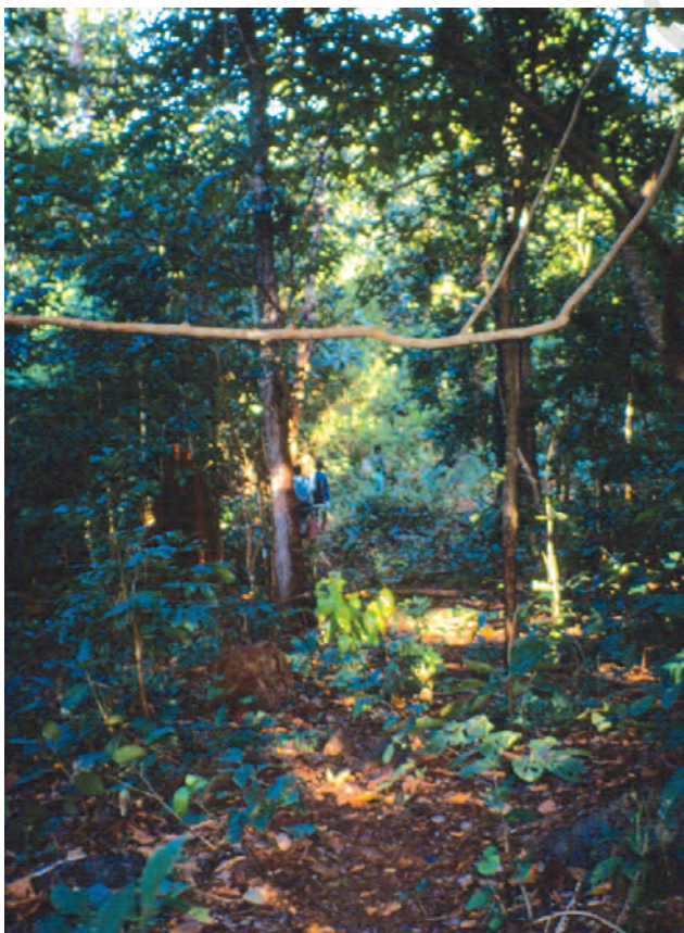
Fig. 1 – A sal forest in Chhattisgarh.

A lot of this diversity is fast disappearing. Between 1700 and 1995, the period of industrialisation, 13.9 million sq km of forest or 9.3 per cent of the world's total area was cleared for industrial uses, cultivation, pastures and fuelwood.