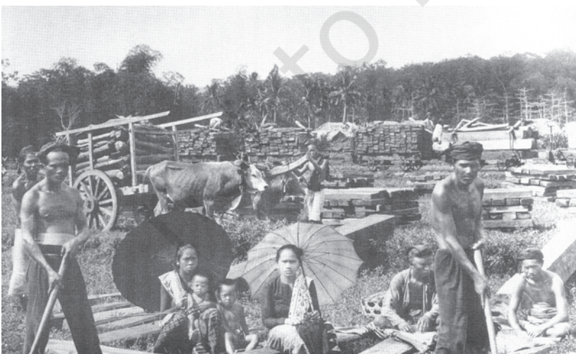
Fig.24 – Log yard in Rembang under Dutch colonial rule.

The Allies would not have been as successful in the First World War and the Second World War if they had not been able to exploit the resources and people of their colonies. Both the world wars had a devastating effect on the forests of India, Indonesia and elsewhere. The forest department cut freely to satisfy war needs.