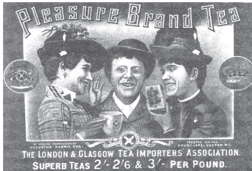
Fig.8 – Pleasure Brand Tea.

Large areas of natural forests were also cleared to make way for tea, coffee and rubber plantations to meet Europe's growing need for these commodities. The colonial government took over the forests, and gave vast areas to European planters at cheap rates. These areas were enclosed and cleared of forests, and planted with tea or coffee.