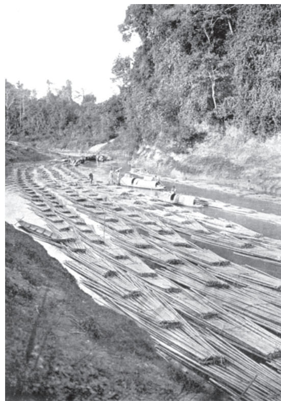
Fig.4 – Bamboo rafts being floated down the Kassalong river, Chittagong Hill Tracts.

From the 1860s, the railway network expanded rapidly. By 1890, about 25,500 km of track had been laid. In 1946, the length of the tracks had increased to over 765,000 km. As the railway tracks spread through India, a larger and larger number of trees were felled. As early as the 1850s, in the Madras Presidency alone, 35,000 trees were being cut annually for sleepers. The government gave out contracts to individuals to supply the required quantities. These contractors began cutting trees indiscriminately. Forests around the railway tracks fast started disappearing.