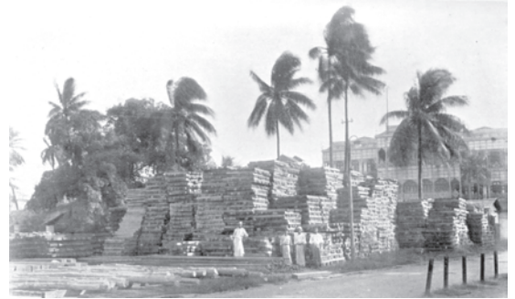
Fig.23 – Indian Munitions Board, War Timber Sleepers piled at Soolay pagoda ready for shipment, 1917.

Since the 1980s, governments across Asia and Africa have begun to see that scientific forestry and the policy of keeping forest communities away from forests has resulted in many conflicts. Conservation of forests rather than collecting timber has become a more important goal. The government has recognised that in order to meet this goal, the people who live near the forests must be involved. In many cases, across India, from Mizoram to Kerala, dense forests have survived only because villages protected them in sacred groves known as sarnas , devarakudn , kan , rai , etc. Some villages have been patrolling their own forests, with each household taking it in turns, instead of leaving it to the forest guards. Local forest communities and environmentalists today are thinking of different forms of forest management.