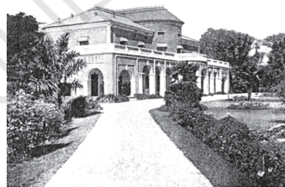
Fig. 11 – The Imperial Forest School, Dehra Dun, India. The first forestry school to be inaugurated in the British Empire.

Foresters and villagers had very different ideas of what a good forest should look like. Villagers wanted forests with a mixture of species to satisfy different needs – fuel, fodder, leaves. The forest department on the other hand wanted trees which were suitable for building