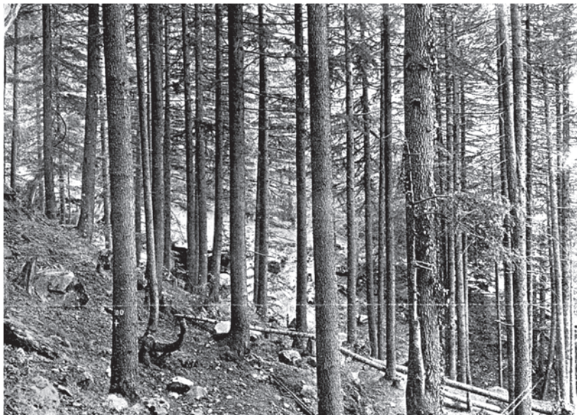
Fig. 10 – A deodar plantation in Kangra, 1933. From Indian Forest Records , Vol. XV.

punished. So Brandis set up the Indian Forest Service in 1864 and helped formulate the Indian Forest Act of 1865. The Imperial Forest Research Institute was set up at Dehradun in 1906. The system they taught here was called ‘ scientific forestry ’. Many people now, including ecologists, feel that this system is not scientific at all.