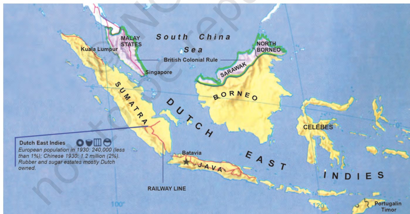
Fig.22 – Most of Indonesia's forests are located in islands like Sumatra, Kalimantan and West Irian. However, Java is where the Dutch began their 'scientific forestry'. The island, which is now famous for rice production, was once richly covered with teak.

Dirk van Hogendorp, cited in Peluso, Rich Forests, Poor People , 1992.