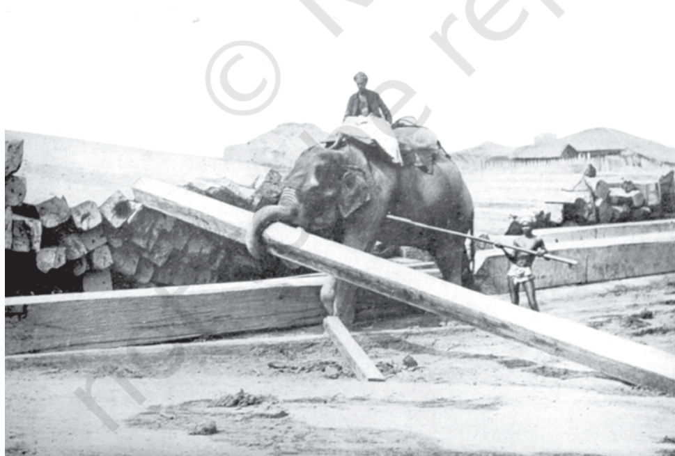
Fig.5 – Elephants piling squares of timber at a timber yard in Rangoon. In the colonial period elephants were frequently used to lift heavy timber both in the forests and at the timber yards.