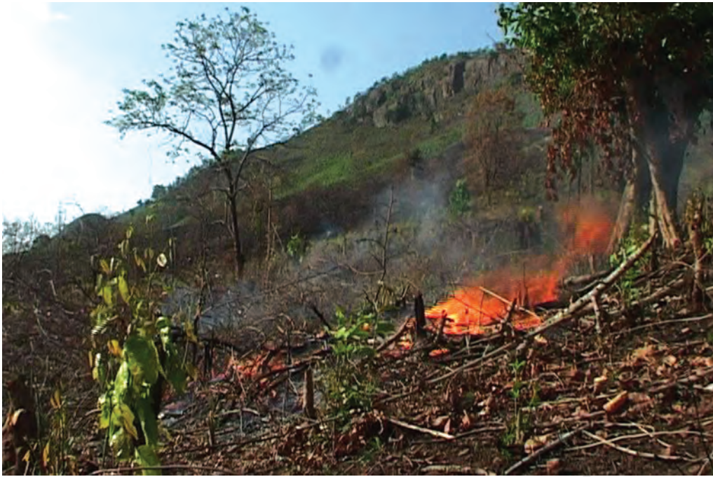
Fig. 16 – Burning the forest penda or podu plot.

In shifting cultivation, a clearing is made in the forest, usually on the slopes of hills. After the trees have been cut, they are burnt to provide ashes. The seeds are then scattered in the area, and left to be irrigated by the rain.