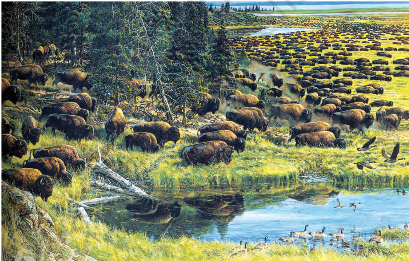
Fig.2 – When the valleys were full. Painting by John Dawson.

In 1600, approximately one-sixth of India's landmass was under cultivation. Now that figure has gone up to about half. As population increased over the centuries and the demand for food went up, peasants extended the boundaries of cultivation, clearing forests and breaking new land. In the colonial period, cultivation expanded rapidly for a variety of reasons. First, the British directly encouraged