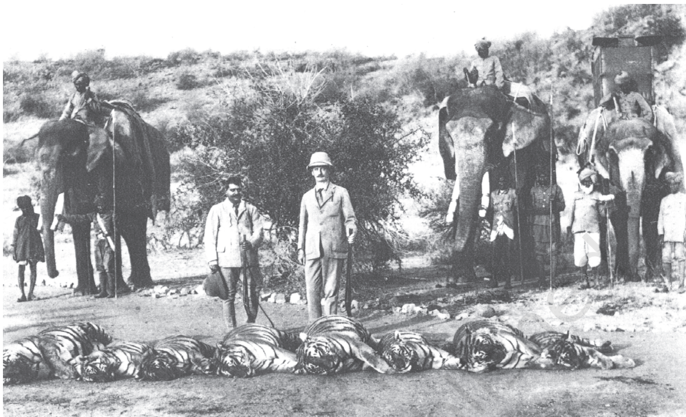
Fig. 18 – Lord Reading hunting in Nepal.

Count the dead tigers in the photo. When British colonial officials and Rajas went hunting they were accompanied by a whole retinue of servants. Usually, the tracking was done by skilled village hunters, and the Sahib simply fired the shot.