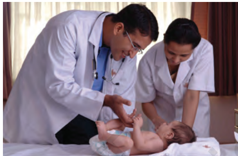
Most babies do not get basic healthcare

The problem does not end with Infant Mortality Rate. The last column of table 1.4 shows that about half of the children aged 14-15 in Bihar are not attending school beyond Class 8. This means that if you went to school in Bihar nearly half of your elementary class friends would be missing. Those who could have been in school are not there! If this had happened to you, you would not be able to read what you are reading now.