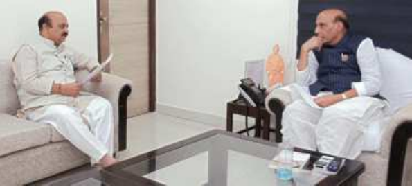
Defence Minister Rajnath Singh and Karnataka CM Basavaraj Bommai in New Delhi on Tuesday.

Mr. Bommai is in the national capital and held discussions with senior advocate in the State’s legal panel Mukul Rohatgi in the wake of the case being listed to come up before the Supreme Court for hearing on Wednesday.