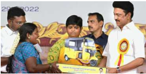
Chief Minister M.K. Stalin distributing welfare assistance to beneficiaries in Ariyalur district on Tuesday.

Speaking at a government function in Ariyalur district, which was organised jointly with the Perambalur district administration, he said law and order in the State was stable. But while some were trying to create issues of law and order, others were