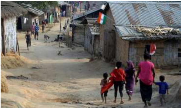
Behind influx: The members of the community fled Bangladesh following a crackdown against the Kuki-Chin fighters.

While civil society groups and the State government have made arrangements for the stay of refugees in schools in Miz-