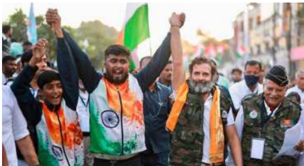
Walking on: Congress leader Rahul Gandhi during the Bharat Jodo Yatra in Indore on November 27.