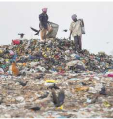
Chart 1 | The chart shows the various sources of solid waste generated in Delhi in 2020-21. Over 4 lakh tonnes of municipal solid waste was generated in the capital in 2020-21

Chart 1 and Table 2 are sourced from “Envi Stats - India 2022”, published by the Ministry of Statistics and Programme Implementation. Table 3 is sourced from the NITI Aayog SDG Index