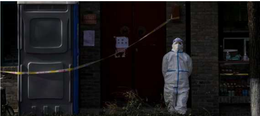
Under watch: A COVID-prevention worker guarding the entrance of a residential compound placed under lockdown in Beijing, China, on Tuesday.

China's government on Tuesday said it would launch a new push to vaccinate the elderly - a key step that would enable an eventual easing of the unpopular "zero-COVID" policy - while also pledging to crack down on activities that "disrupt social order". The ruling Chinese Communist Party leadership has not yet directly commented on the widespread and unprecedented protests over the weekend in cities across China but has appeared to respond with a two-pronged approach to deal with rising public anger over continuing lockdown restrictions. On Tuesday, health officials unveiled a plan to boost vaccination rates among the elderly, a key metric that the government has cited to justify the "zero-COVID" policy warning that opening up would lead to mass deaths. Officials said of the 30 million Chinese aged 80