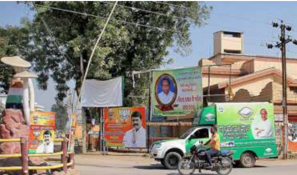
Tough fight: Poll campaign signboards seen at Padmapur in Bargarh district of Odisha.

The usual goodies are showered on the marginalised population as every vote of over 2.5 lakh electors counts in the Padmapur bypoll which will set the tone of the political