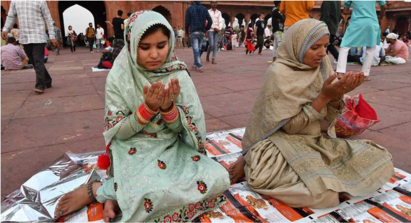
Entry for all: Women gathered at Jama Masjid offering prayers on the eve of Eid-UL-Fitr on May 2.

While there is a clear difference of opinion among Islamic scholars on the right of women to visit a dargah or a cemetery, there is lesser disagreement on a woman's right to offer prayers inside a masjid. Most Islamic scholars agree that a prayer can be offered at home but can only be established in a group, hence the importance of going to a mosque. Most also agree that women have been exempted, not prohibited from going to the mosque, keeping in mind their child-rearing and other domestic responsibilities. In fact, the Quran at no place prohibits women from going to mosques for prayers. For instance, verse 71 of Surah Taubah, says, "The believing