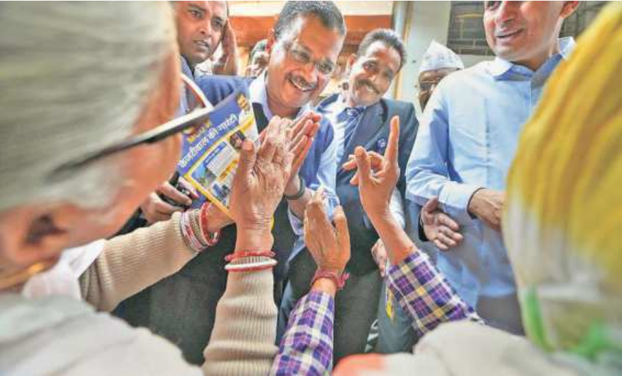
The intent behind the scheme is to decentralise power, said Chief Minister Arvind Kejriwal. PTI

The AAP national convener addressed Delhi's voters after a break of over a week, during which he was campaigning for the Gujarat Assembly election. The Delhi CM went on a door-to-door campaign in