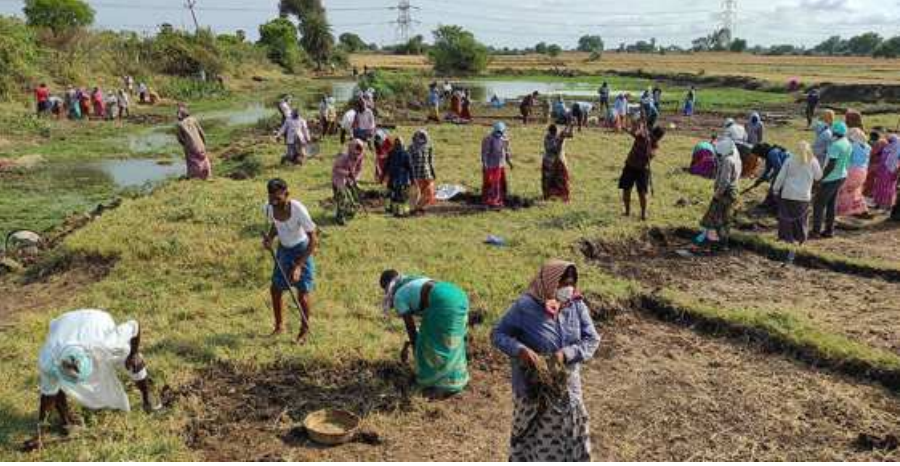
Response to violation: The Centre, in its notice, threatened to take action against the State under Section 27 of the MGNREGA.

Based on the team’s observations, a report was sent to the State asking for clarifications. Following the State government’s clarifications, the total amount of recovery was re-