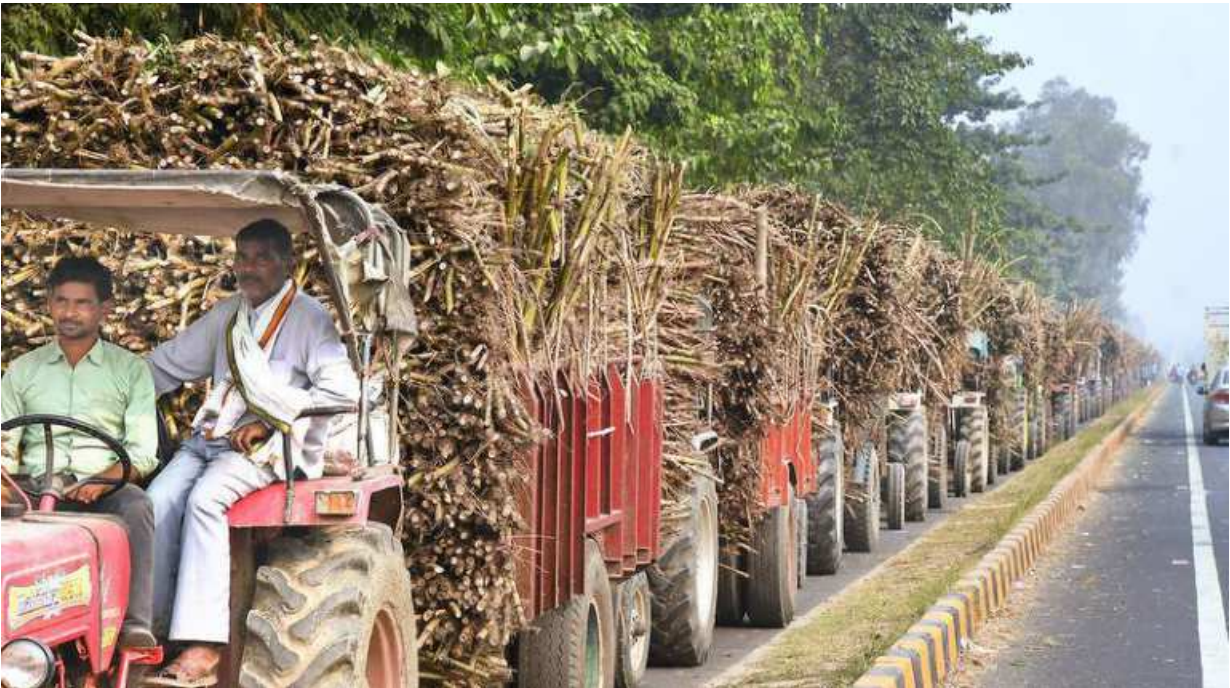
A long queue of tractor-trolleys loaded with sugarcane waiting at Hata village, on the outskirts of Kushinagar, in Uttar Pradesh, to sell their produce to a private sugar mill on Tuesday.