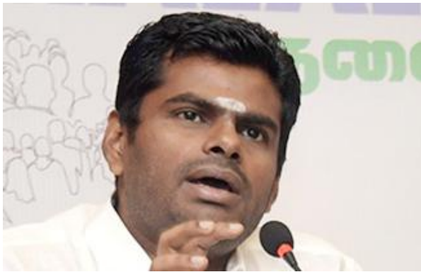
Tamil Nadu BJP chief K. Annamalai has demanded an impartial probe into the issue.

‘Metal detectors faulty’ Claiming to be in possession of a communication sent by the Union government to the Tamil Nadu police after the visit, he said most of the hand-held metal detectors, door-frame metal detectors and bomb detectors were not in order and overdue for maintenance or replace-