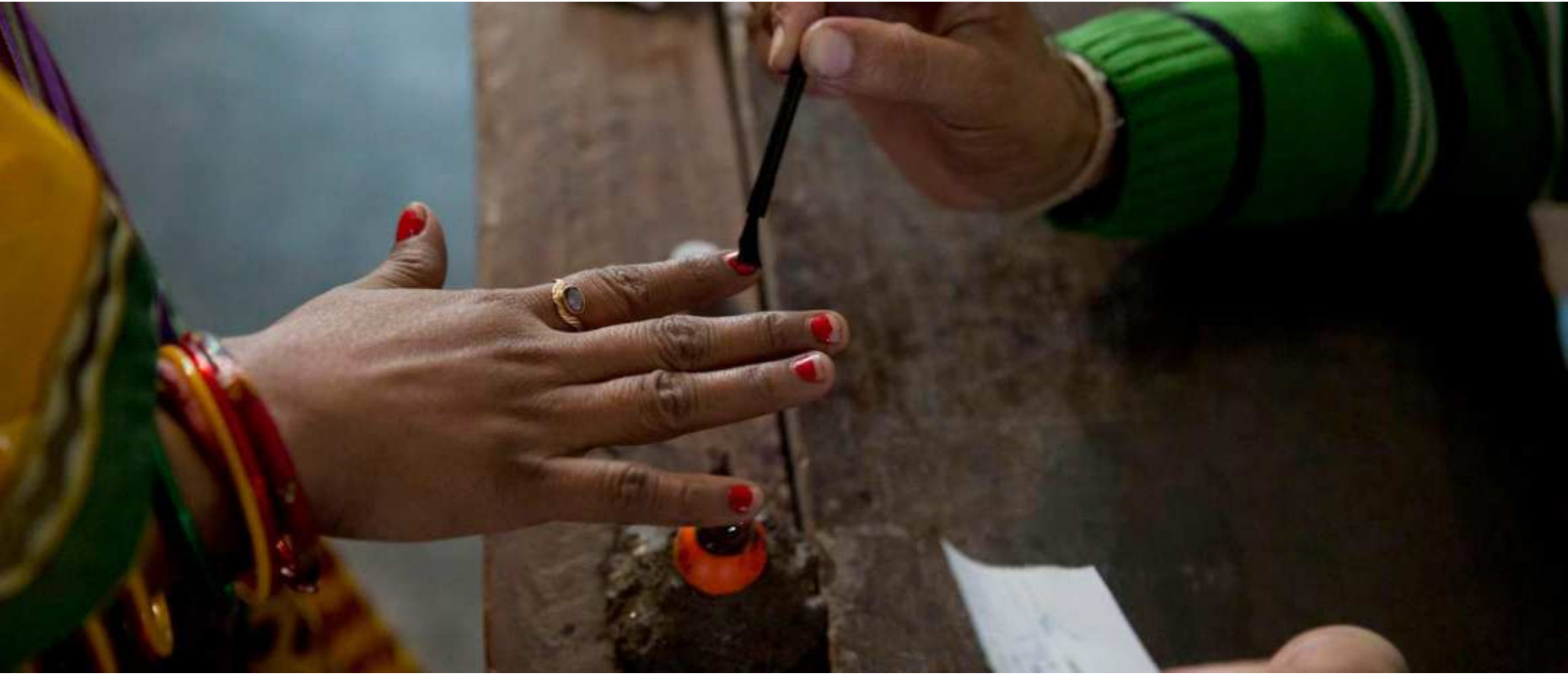
A polling official, marks the finger of a woman with indelible ink before she casts her vote.

Trying to find meaning in the Duverger’s Law, the authors of this paper take a closer look at the types of voters and voting patterns in the State of Uttar Pradesh to understand mass electoral behaviour in the country