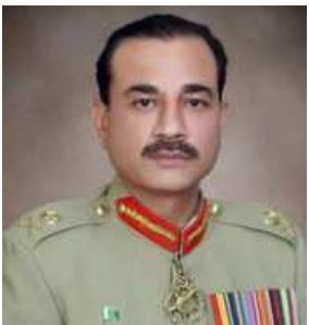
General Asim Munir

pected car-ramming north of Jerusalem, the Army said. Jerusalem's Shaare Tzedek hospital confirmed the alleged attacker had been killed. The West Bank has suffered spiralling violence this year, with near daily Israeli Army raids leading to scores of deaths.