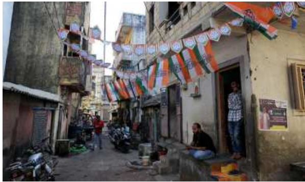
Door-to-door: Congress flags line the streets of a neighbourhood in Somnath as Gujarat goes to polls. VIJAY SONEJI

On Tuesday, the last day of campaigning for the 89 seats that go to the polls in the first phase on December 1, Somnath-Veraval witnessed a show of