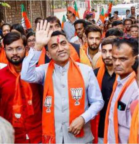
Final push: (Left) Goa Chief Minister Pramod Sawant seeking votes for the BJP in Ahmedabad on Tuesday, while Congress chief Mallikarjun Kharge campaigns for his party the previous day.

Amid allegations and counter-allegations, a long-drawn campaign by the ruling BJP, the Congress and the Aam Aadmi Party, the newest entrant in the political arena in the State, ended in what appears to be a dull election season compared with that in 2017, when the election was held against