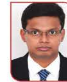
CB Rex AIR-111