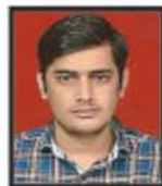
GIRDHAR AIR 61