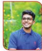
Alfred Ov AIR-57