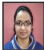
BHAWNA AIR 68